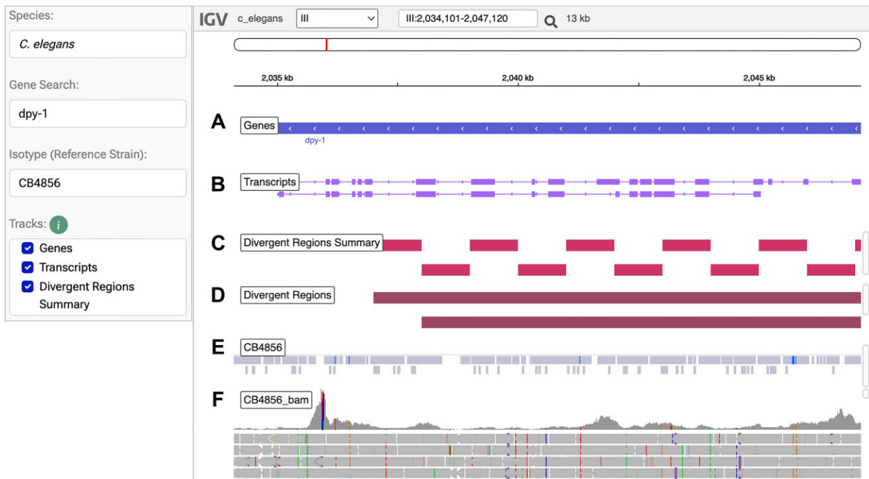
Figure 1. The CaeNDR genome browser. The user specifies the Species in the setup panel to the left. The optional Gene Search field will direct the browser to that gene in the genome (A) and display transcripts in the track below (B). The Divergent Regions Summary track shows regions of the genome that are classified as hyper-divergent relative to the reference genome in any isotype reference strain within the species (C). The Divergent Regions track displays regions that are hyper-divergent relative to the reference genome for individual isotype reference strains, each track feature can be clicked to reveal the isotype reference strain the feature belongs to (D). The Isotype field in the setup window on the left is optional and allows users to add VCF and BAM tracks to the browser. The VCF track shows species-wide SNV and short indels in gray, with the variants specific to the isotype reference strain in blue (E). The BAM track shows read level data from which the variants were called. The top of the track shows read depth and the bottom shows the paired-end reads (F).